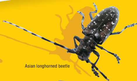
Asian longhorned beetle