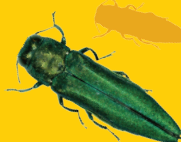
emerald ash borer