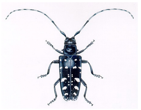
approximate actual size

Cut out each rectangle; do not follow contour of the antenna, it will be too floppy for the mask. Color antenna segments- white or blue on the bottom of each segment and black on the top of each segment. Fold the rectangle in half lengthwise, and staple the long thin rectangle shut. Staple antennae onto mask using the white space at the bottom.