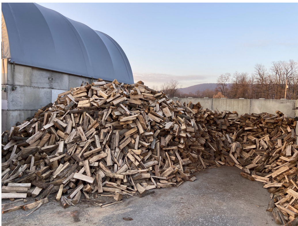
Photo of a large firewood stack in winter. Is it spring yet?