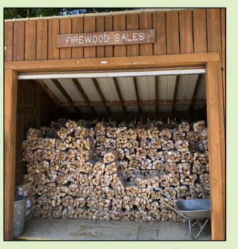
Firewood is available for purchase at all staffed state campgrounds.