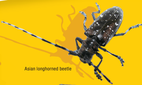
Asian longhorned beetle