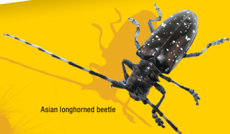
Asian longhorned beetle