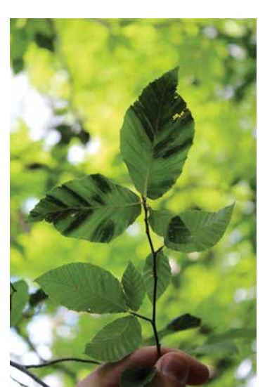
Figure 1.—Banding appearance associated with BLD.

BLD appears to be spreading, particularly from west to east based on the number of new county detections in 2019 and 2020. Insect or avian vectors as well as human-mediated movement of the nematode are possible modes of its dispersal that are currently being studied. There is likely a delay between initial nematode infestation and BLD detection as L. crenatae has occasionally been confirmed in asymptomatic tissue at the molecular level.