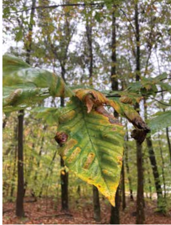
Figure 3.—Advanced symptoms of BLD with chlorotic striping.